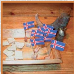
Shark and dried fish served with Icelandic schnapps.