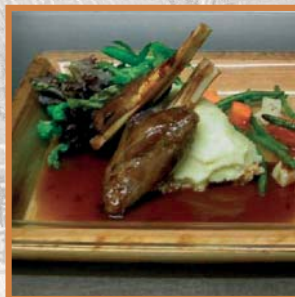
Braised lamb shank with potato purée and glazed vegetables.