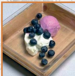
Skyr, traditional yogurt with blueberry sauce and sorbet.